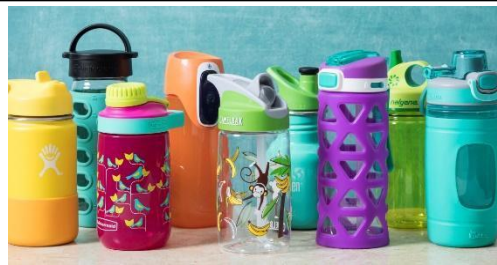
Any DISHWASHER safe, unbreakable water bottle