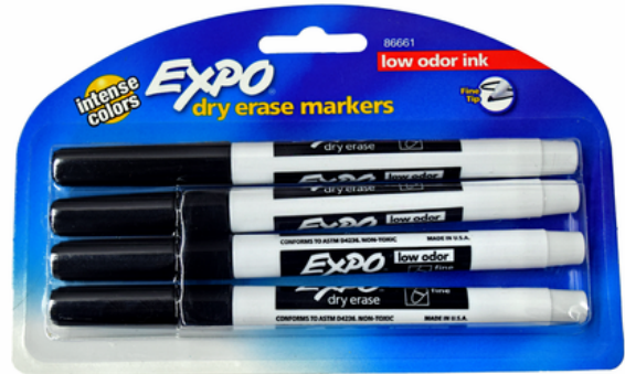
Expo, black, fine point dry erase markers