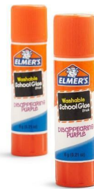
Elmer's Brand Glue