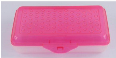
Pencil case, any color