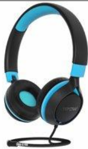
Basic over-head headphones, any color