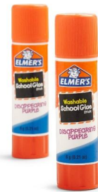
Elmer's Brand Glue