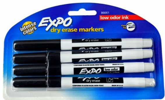
Expo, black, fine point dry erase markers