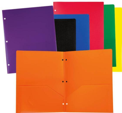
Plastic, 3 holed folder, any color