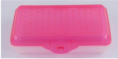
Pencil case, any color