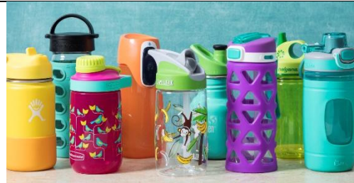
Any DISHWASHER safe, unbreakable water bottle