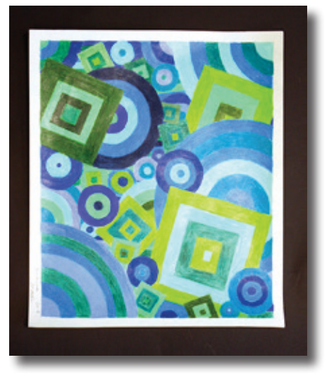
"Color Theory Shapes" Colored pencil on paper