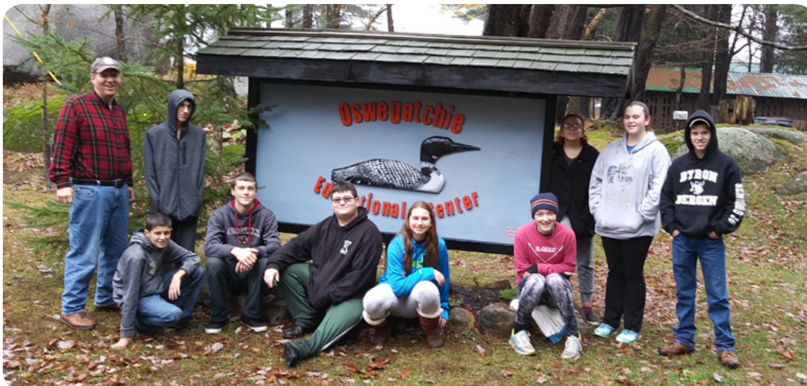
Byron-Bergen FFA members at Camp Oswegatchie for the Environmental Science and leadership training program in November 2017.

The school's Advisory Committee includes expert volunteers from the community: several grain and vegetable crop farmers, a veterinarian, an agronomist, and a hobby farmer. They provide planning guidance now, and hope to increase their involvement as speakers, mentors, and resources as the program grows.