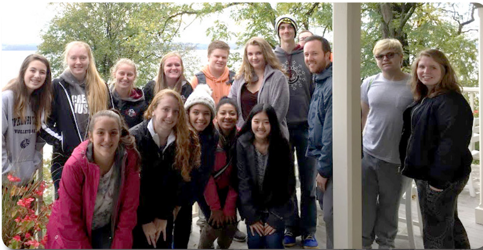
Pictures from our college field trip to Hobart and William Smith Colleges in Geneva, NY.

Our junior high school students are also beginning to explore their personal and career interests in the College and Career Center. Our hope is to have students identify their interests at an earlier age to help make more informed decisions in the future. The future is exciting and full of opportunity. We hope that each student leaves Byron-Bergen feeling the same way!