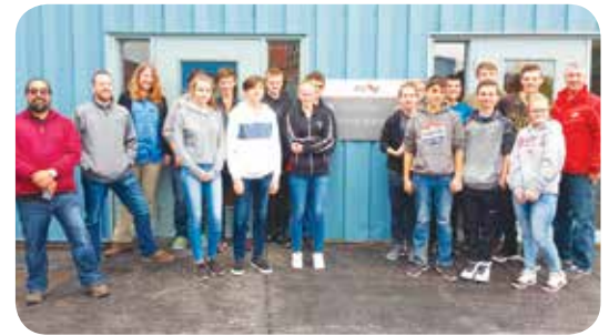
Rochester Area College Fair comes to B-B