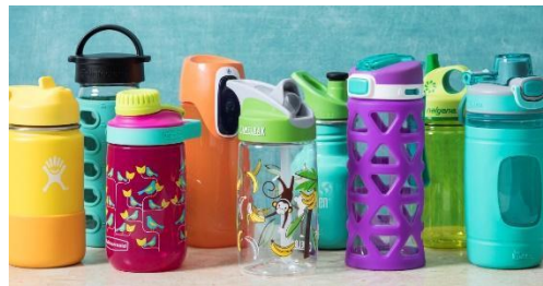
Any DISHWASHER safe, unbreakable water bottle