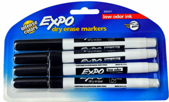
Expo, black, fine point dry erase markers