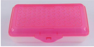
Pencil case, any color