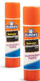
Elmer's Brand Glue