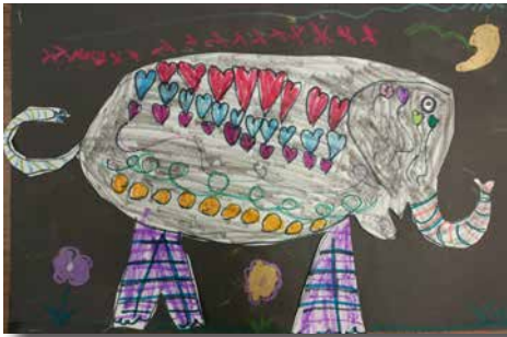
“Elephant” Mixed Media