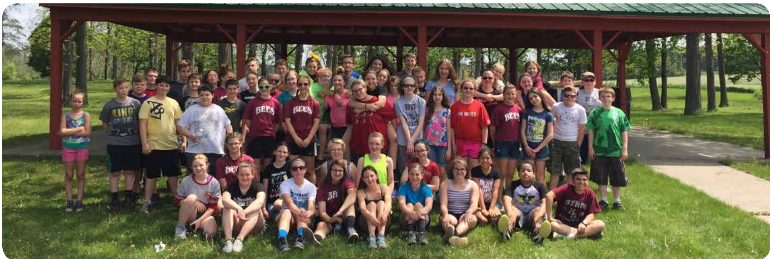
Byron-Bergen's Class of 2022 at the Village of Bergen's 13th annual Community Action Day.

"We truly believe that the school-community partnership is essential for creating pride in our community. Listening to our kids talk about how much they enjoyed volunteering is what it is all about."