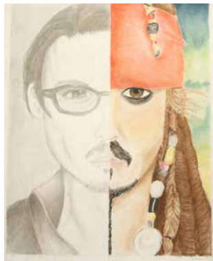
“Alter Ego (Johnny Depp)”