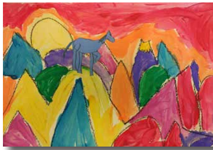
“Blue Horse” Mixed Media