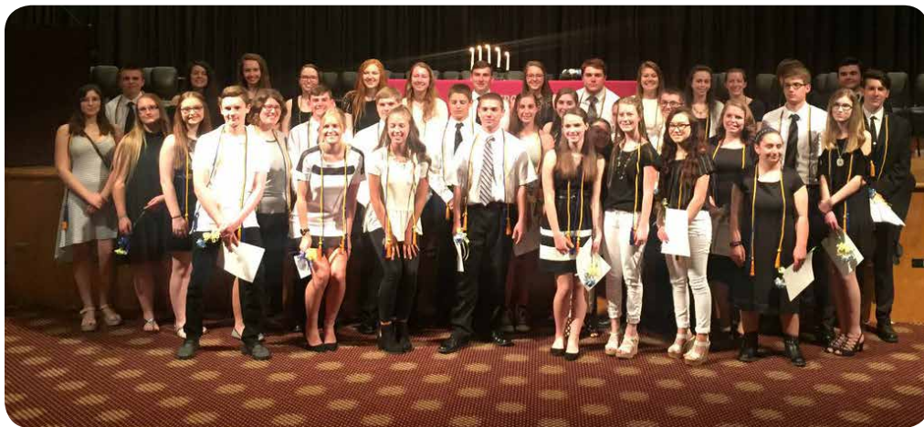
Byron-Bergen's 2017 National Honor Society.