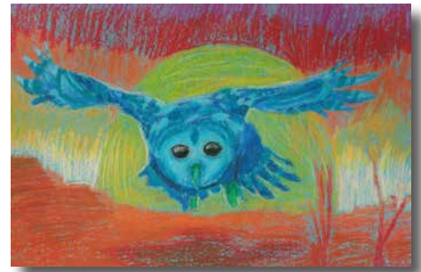
“Owl at Sunset” Oil Pastel on Paper