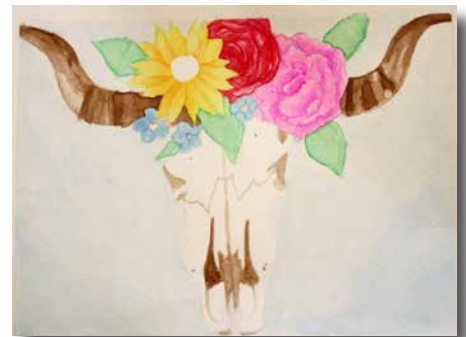
“Flowers and Skull”